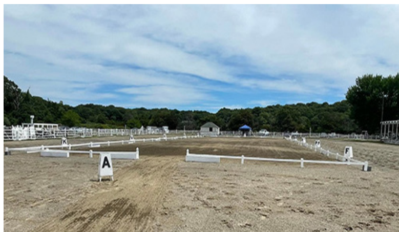
The arena is ready for the start of the show.